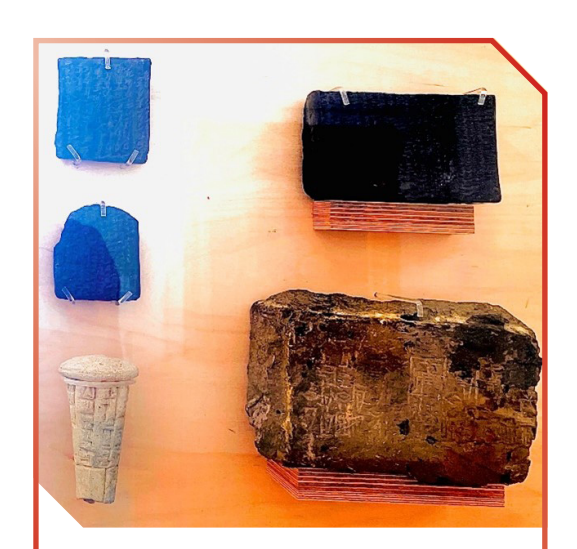
Can you find the cuneiforms?