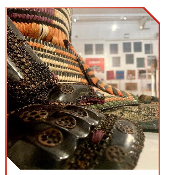
Can you find the samurai armour?